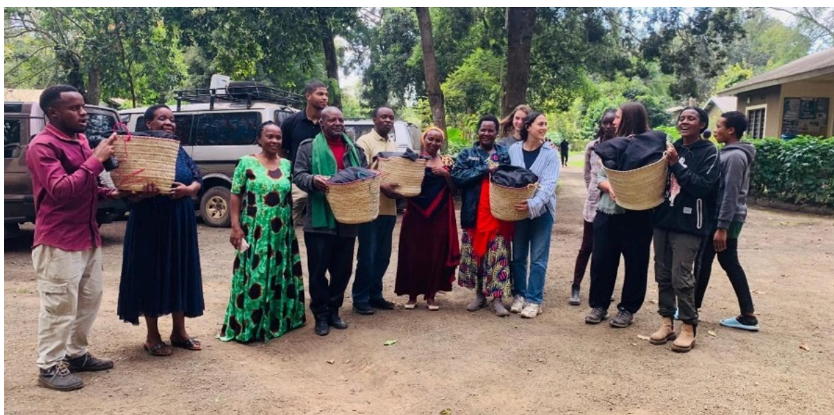
Some of the participants showing the Bean Bag cookers they made as part of the training at ECHO East Africa, made possible by the Kirkwall Baptist support

25 participants, participated in a practical training session to learn about the use and benefits of the Bean Bag Cooker (BBC) including a practical demonstration on how to make one. Each of the four community participants received the BBC they made during the training to take home and test in their daily lives. The project team later conducted follow-up interviews with the participating families to assess the impact and gather feedback on the use of the BBC. These interviews showed significant benefits in terms of energy efficiency, time savings, and overall household convenience.